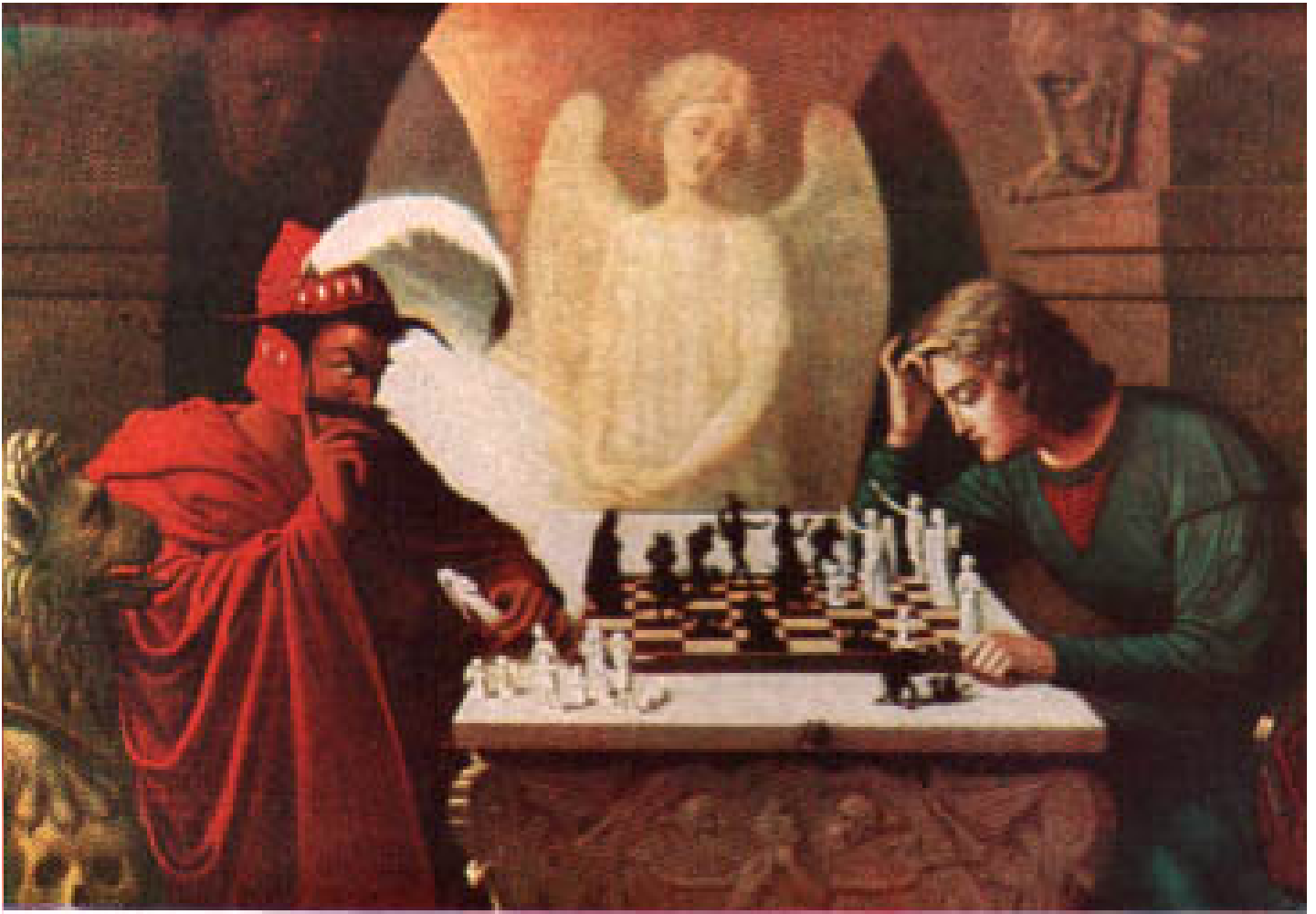
Satan spielt mit dem Menschen um dessen Seele.